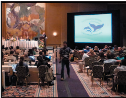
Over 200 people from 40 countries attended the ICMMPA.

Several major announcements were also made during the event, including the exploration of a bilateral "sister Sanctuary" agreement between NOAA's Hawaiian Islands Humpback Whale National Marine Sanctuary (HIHWNMS) and the Komandor Islands State Biosphere Reserve in the Russian Aleutian Islands. Also discussed was an expansion of the Office of National Marine Sanctuaries' memorandum of agreement with the National Park Service to include a bilateral agreement with Glacier Bay National Park in Alaska and HIHWNMS. In addition the newly formed French Agence des Aires Marines Protégées announced that they would explore hosting the next ICMMPA planned for 2012 and would seek the continued engagement of all interested governments, non-government organizations and individual experts, such as the existing steering committee.