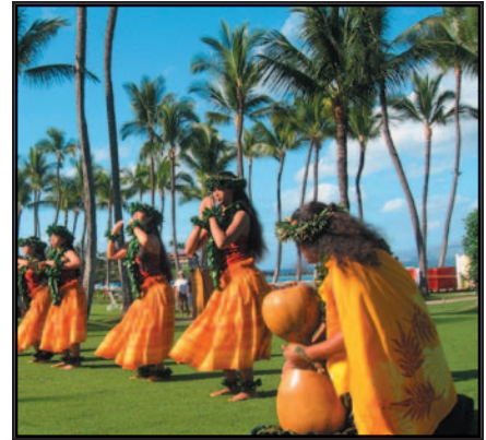
A traditional Hawaiian blessing and hula opened the conference.

The First International Conference on Marine Mammal Protected Areas (ICMMPA) was held in Maui (March 30 – April 3, 2009). More than 200 marine mammal scientists, marine protected area (MPA) managers and other experts from 40 countries agreed that this gathering in Hawai'i was long overdue and an extremely valuable exchange of science and management practices, as well as an unprecedented opportunity for networking. Results and recommendations from the event will be presented in a variety of venues, and conference proceedings will be produced and posted on the conference web site. In addition, the meeting attendees made consensus recommendations to the steering committee to continue the momentum built by conference workshops and presentations, in order to address common challenges and share solutions for the management of marine mammals around the globe. All attendees agreed that, while they may pose a particular challenge, highly mobile cetaceans are iconic and an obvious choice for linking marine protected areas.